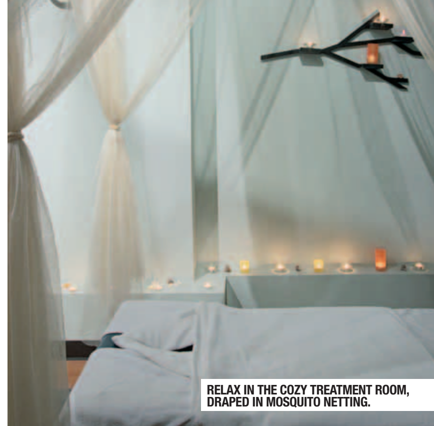
RELAX IN THE COZY TREATMENT ROOM, DRAPED IN MOSQUITO NETTING.